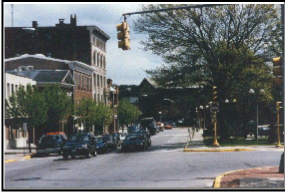
Downtown Fitchburg MA.